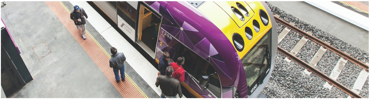
Electrification of the Wyndham Vale Line

The Victorian Government's Western Rail Plan includes a possible metro rail link from Wyndham Vale to Werribee as part of its western section, a critical connection to link the regional and metro lines not only for Wyndham but also for the broader region. This link is therefore an important component for connecting every rail line from Cheltenham to Werribee, as noted in the announced Suburban Rail Loop.