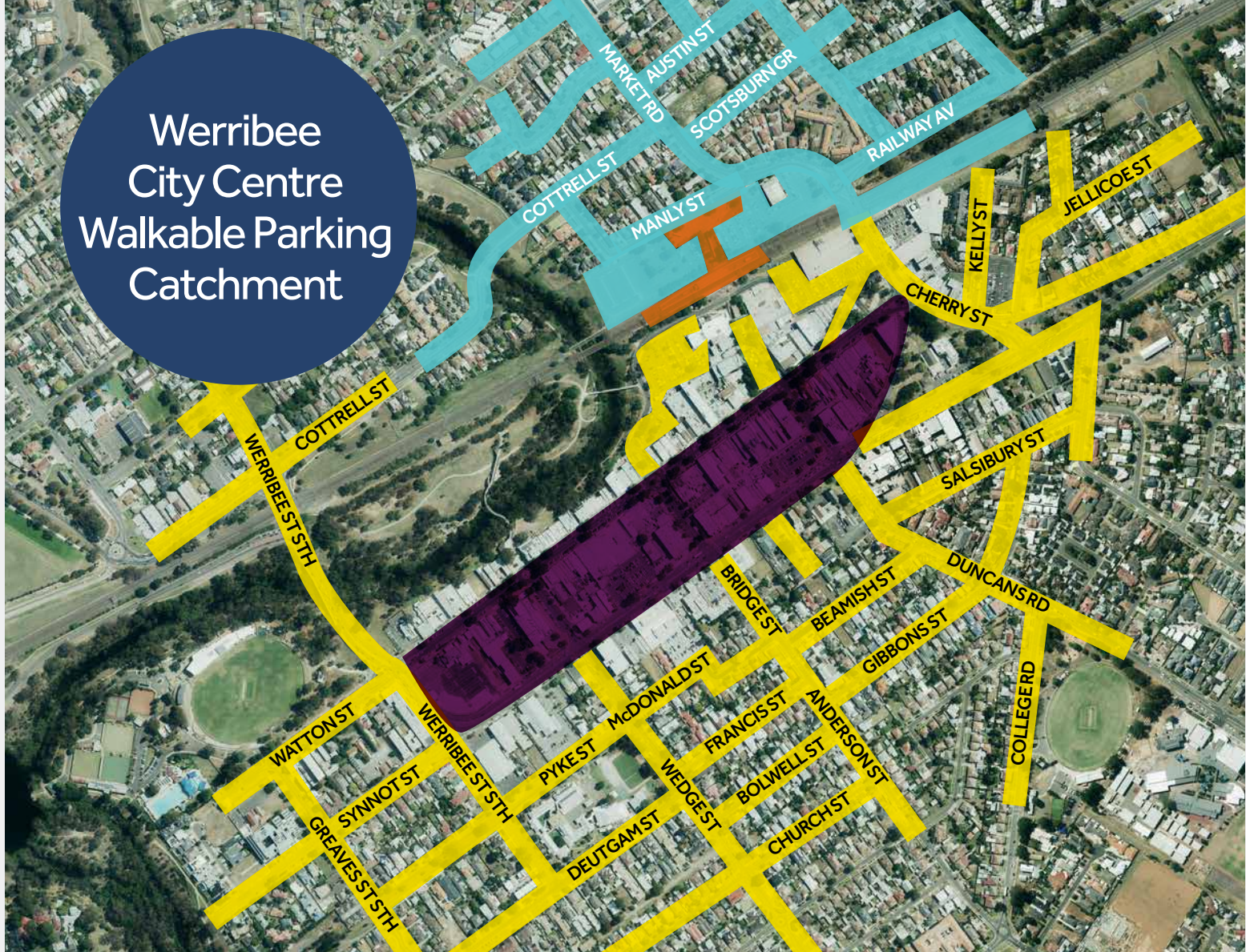
Figure 2: The Werribee City Centre Parking Catchment as defined by a 500m / 7.5 minute walk to/from the Watton St-Synnot St Area and the Train Station.