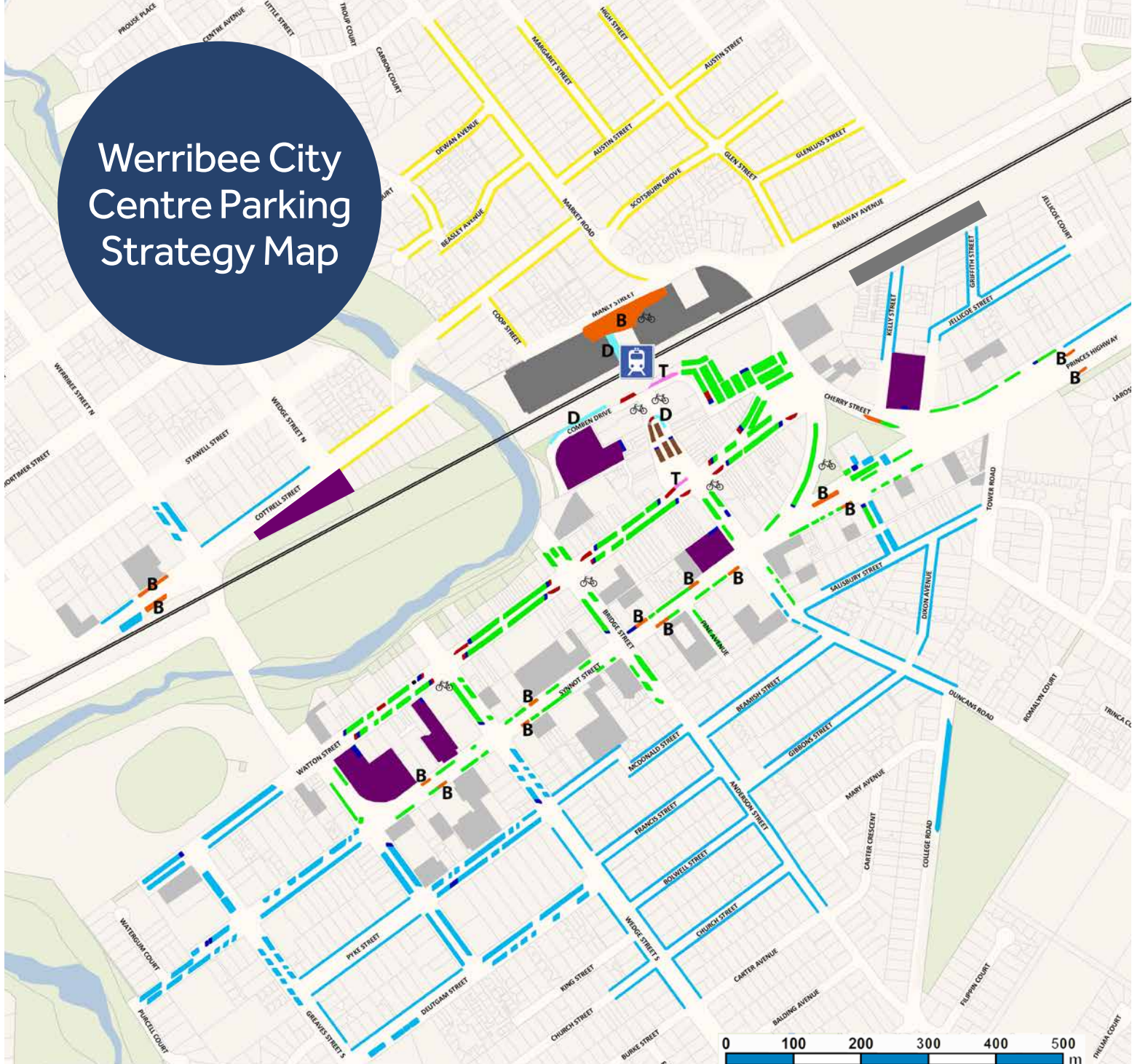
Figure 8: Werribee City Centre Parking Strategy Map