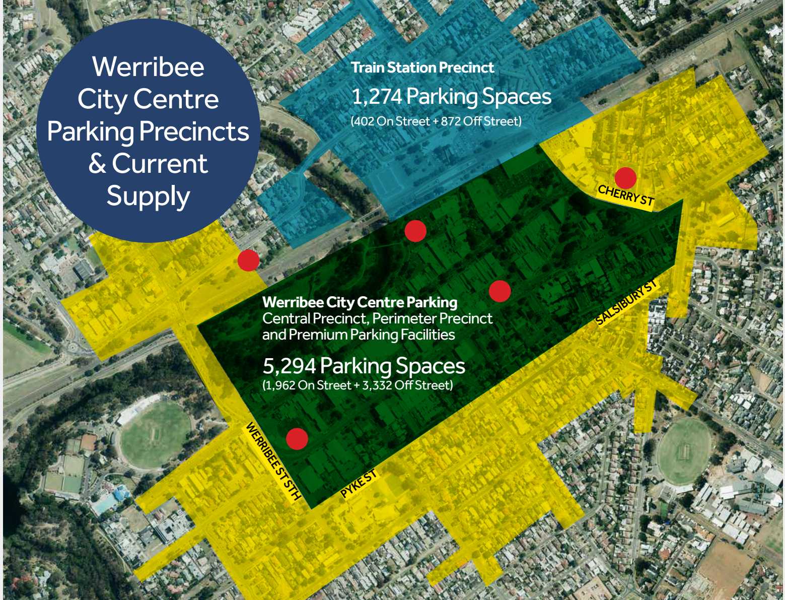
Figure 1: Werribee City Centre Parking Precincts

Werribee City Centre Parking Central Precinct, Perimeter Precinct and Premium Parking Facilities 5,294 Parking Spaces (1,962 On Street + 3,332 Off Street)