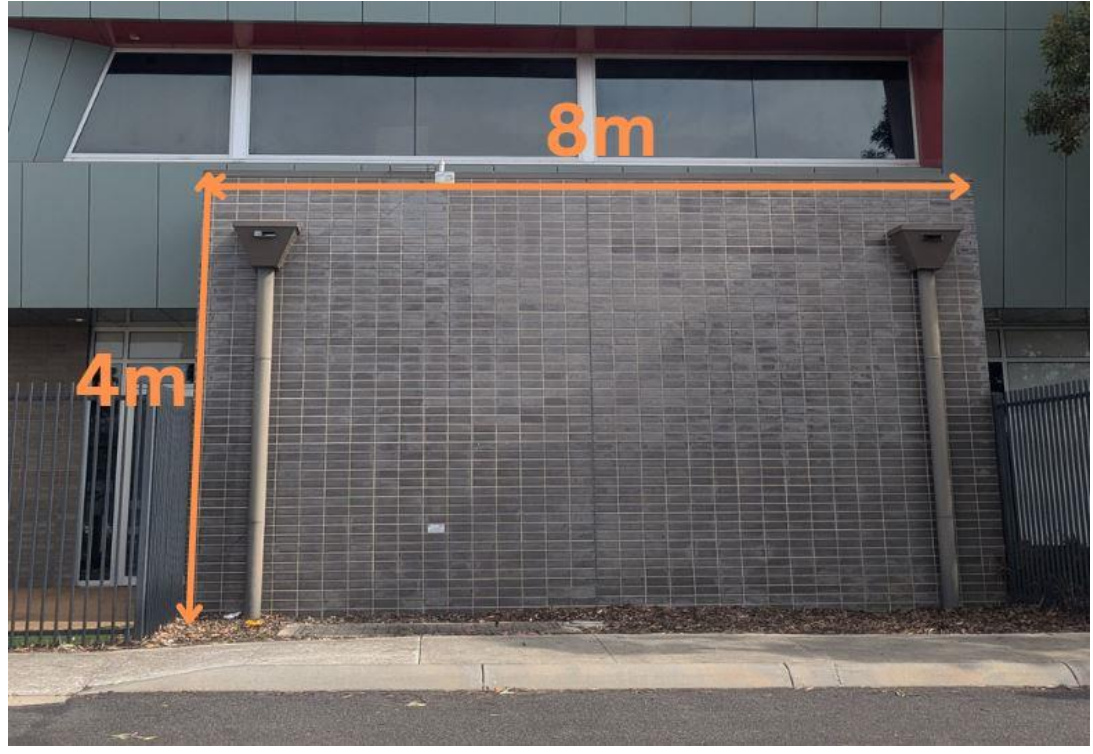
Wall facing Penrose Promenade