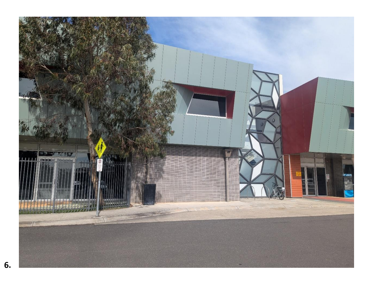
Appendix 3 - Google Street View – 83 Penrose Promenade, Tarneit VIC 3029