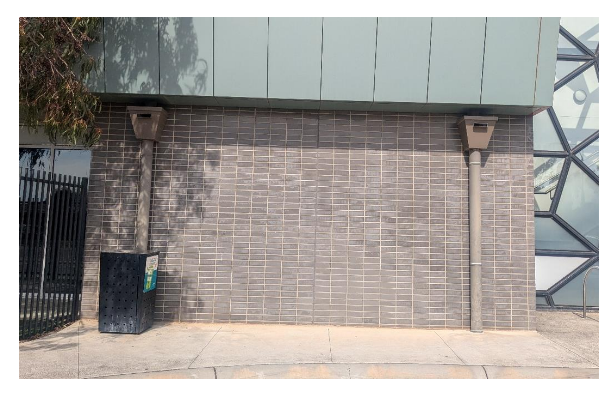
Appendix 2 – Penrose Promenade Community Centre w including communal space view