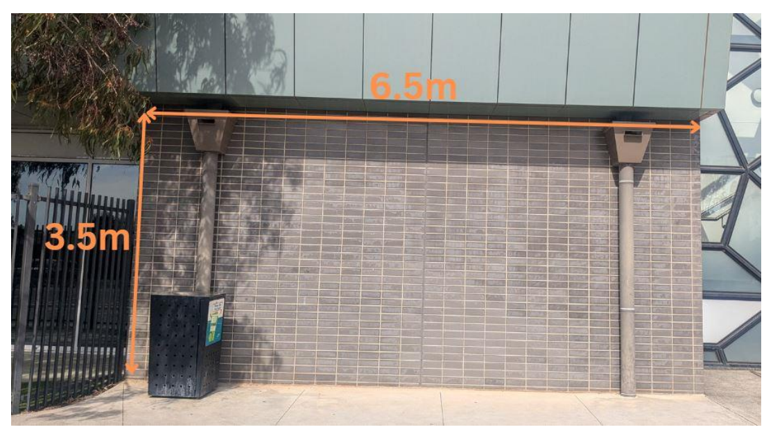
Wall facing Turva Avenue