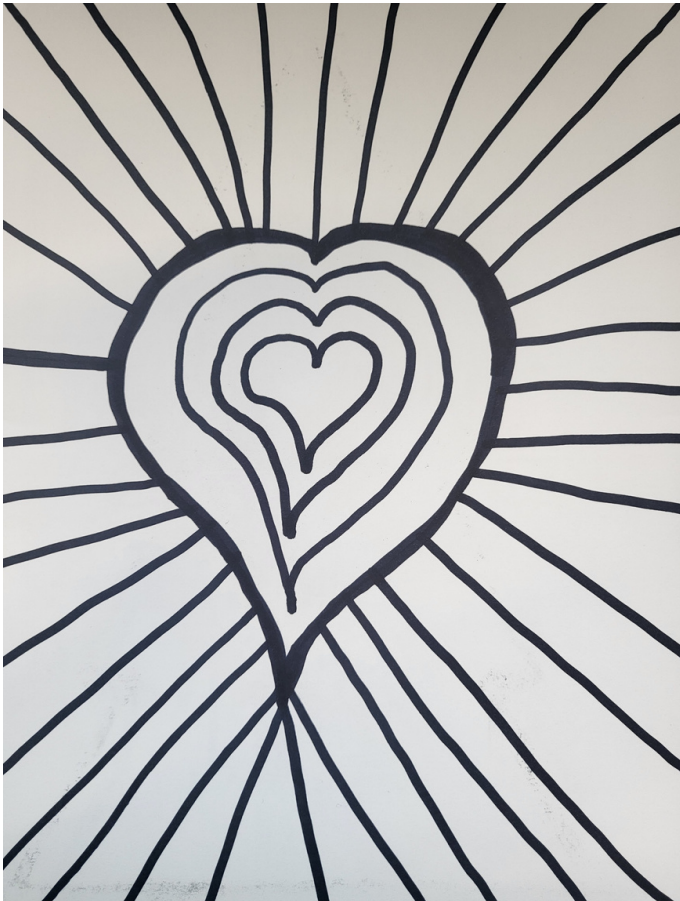
Show us what you have made on the <u>Kids Creations Gallery.</u>